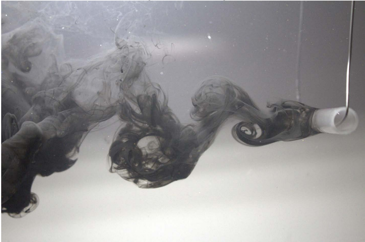
Original, Unedited Image

All post-processing was done using the photo editing software GIMP. Post processing of the image started by cropping out some of the less interesting turbulent flow on the left side of